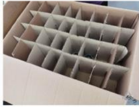
With cardboard divider