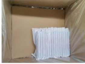
With tissue paper