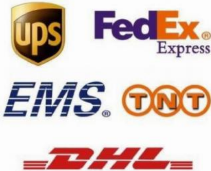
Shipping by air with Express