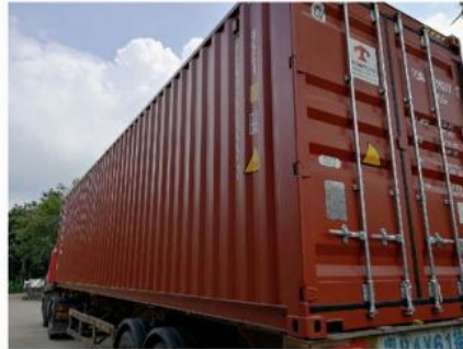
Shipping by sea with container